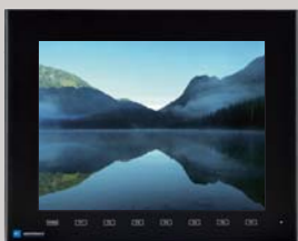
12.1" SVGA (800×600)

V9120iSB V9120iSBD V9120iSLBD V9120iSRBD