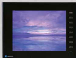
10.4" VGA (640×480)