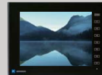
8.4" SVGA (800×600)

V9100iSB V9100iSBD V9100iSLBD V9100iSRBD