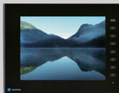
10.4" SVGA (800×600)

V9120iSB V9120iSBD V9120iSLBD V9120iSRBD